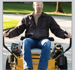
AUTOMATIC PARK BRAKE Auto engages when steering levers are open.