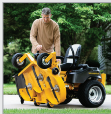
QUICKFLIP™ TECHNOLOGY Raises and lowers deck for easy access to blades.

The Raptor® Flip-Up is the only mower on the market with patent pending QuickFlip™ Technology. Push a button to automatically adjust deck height or access the deck underside. Cleaning, sharpening or changing blades was never so easy. Plus, the Raptor Flip-Up includes all of Hustler's standard residential series features such as SmoothTrak™ steering, patented automatic park brake and deep, heavy-duty welded-steel decks.